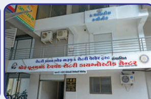
P.D. Shroff Rotary Diagnostic Center