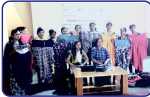
Women Empowerment Project