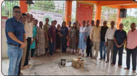
AGANWADI AHAR UTSAV -2