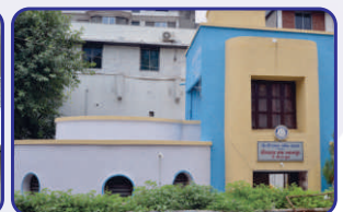
Pay & Use Toilet Blocks