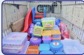
Mobile Toy Library - Ramakdu