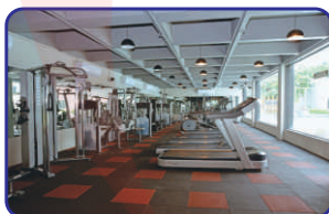
M. I. Patel Rotary Youth Center