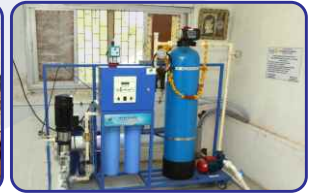
Clean Drinking Water