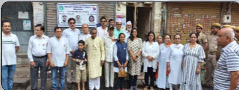
Independence Day Celebration Nrusinh and Ishvariben Aslot Mahila Pustkalay, Junabazar