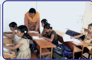
Hum Honge Kamyab - Literacy