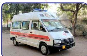
Ambulance & Morgue Vehicle