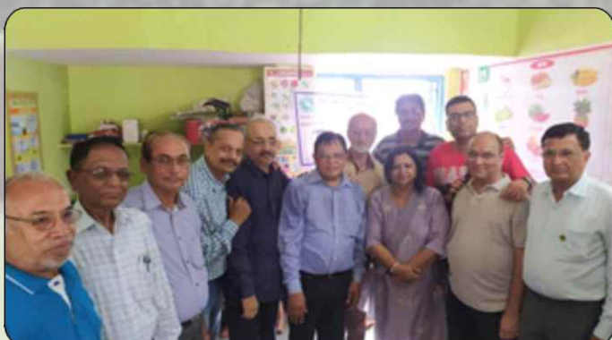
Anganwadi Ahar Utsav 3 at Suthiyapura