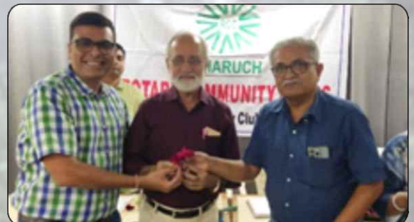
Senior citizen Day Celebration at Rotary Hall